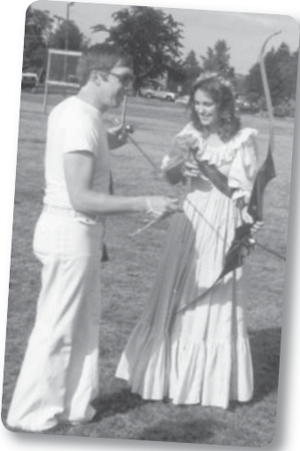
1987 – Maid Marian shooting the first arrow of the match