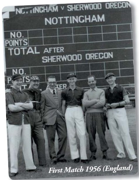
First Match 1956 (England)