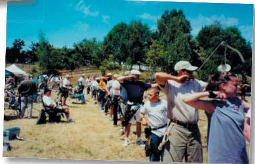
Shooting Line at the Sherwood Elks 2003