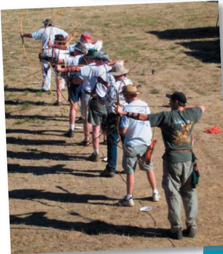
2003 - A group of Long bow shooters